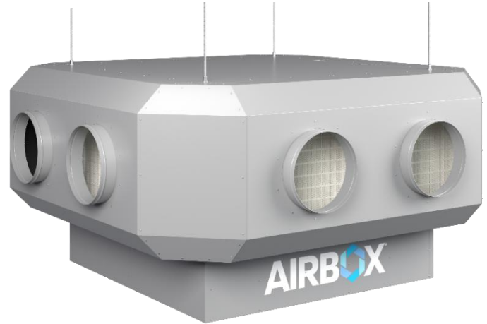
Stratus HVP Without Ducts