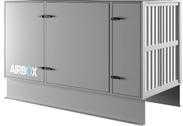
Vortex 9000 HVP