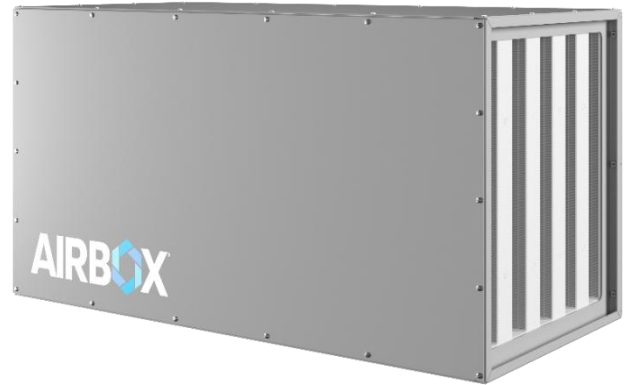
Vortex 2000 HVP