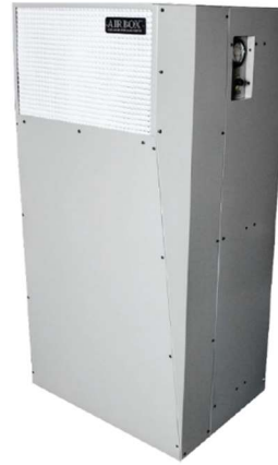
Optional Front Shroud (45° Projection)

AIRBOX is regulated by the US Environmental Protection Agency and state governments as a pesticidal device. Accordingly, our air cleaners are packaged and labeled in accordance with EPA regulations under FIFRA section 2(q)(1) and 40 CFR Part 156. EPA Registered Establishment No.: 97081-NC-1