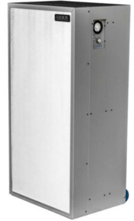
Non-Shrouded (Horizontal Projection)